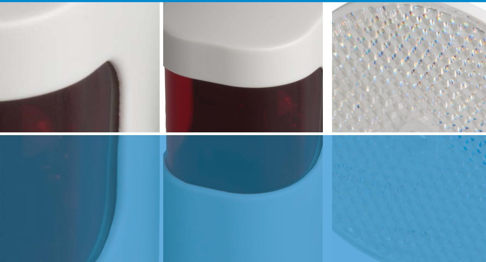
PD86 - Photoelectric sensor